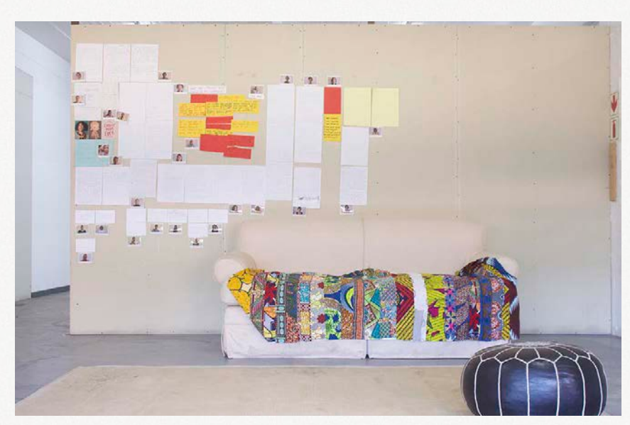
Growing wall of complaints November 2022